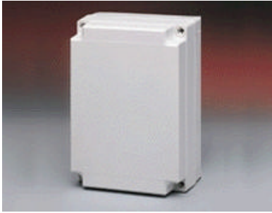
This is a sample photo.