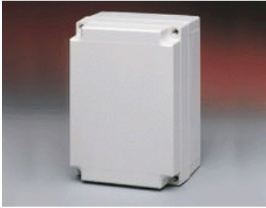
This is a sample photo.