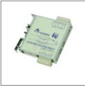
Q501-1xxx (1 channel out) Q501-2xxx (2 channel out)