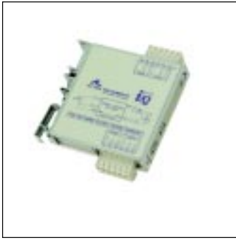
Q510-0xxx (2 Channel) Q510-4xxx (4 Channel)