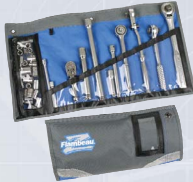
10 pockets for a variety of tools.

Small: 4.25" x 7.75" x 10.25" (36.2 cm x 19.7 cm x 26 cm) Large: 18" x 8.25" x 12.75" (45.7 cm x 21 cm x 32.4 cm)