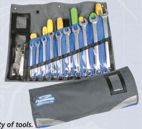
15 pockets for a variety of tools.