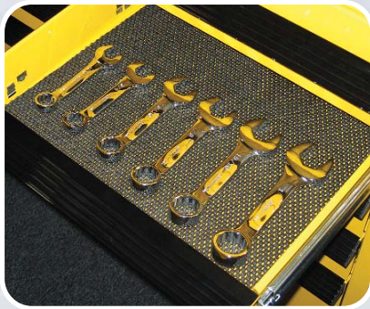
Inhibits rust & corrosion for 2 years!