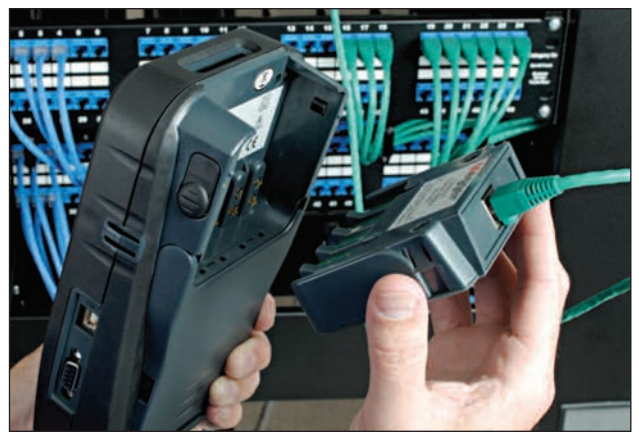
SCT Series adapter employs new "connector-less" adapter technology.