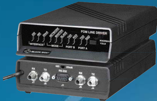
ME540A-ST: top: front view; bottom: rear view

At Black Box, we guarantee the best value and the best support. You can even consult our Technical Support Experts before you buy if you need help selecting just the right component for your application. Don't waste time and money—call Black Box today.