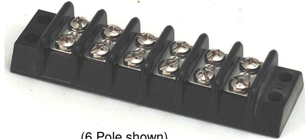
(6 Pole shown)

Replace "XX" with 01 through 24 for number of poles Terminal Block– Closed Back 30 Amps, 600 Volts (AC/DC)