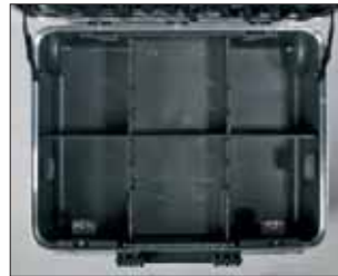
• Bottom area has removable dividers fixed directly on the shell body with no need of additional tray. Lightweight and higher load capacity are ensured.