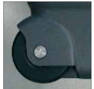
• Wheels on ball bearing