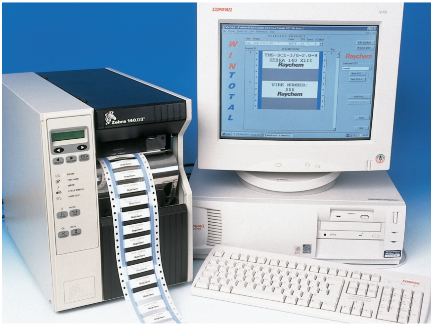
TMS System Six heat-shrinkable markers being printed using WinTotal software.

Important: All information, including illustrations, is believed to be reliable. Users, however, should independently evaluate the suitability of each product for their application. Tyco Electronics makes no warranties as to the accuracy or completeness of the information, and disclaims any liability regarding its use. Tyco Electronics' only obligations are those in the Company's Standard Terms and Conditions of Sale for this product, and in no case will Tyco Electronics or its distributors be liable for any incidental, indirect, or consequential damages arising from the sale, resale, use, or misuse of the product. Specifications are subject to change without notice. In addition, Tyco Electronics reserves the right to make changes—without notification to Buyer—to processing or materials that do not affect compliance with any applicable specification.