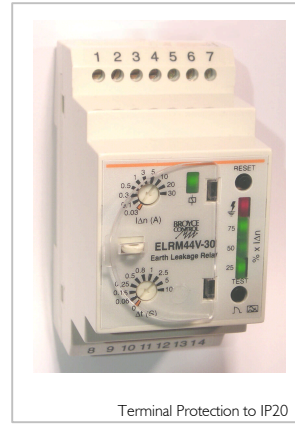
Dims: to DIN 43880 W. 44mm