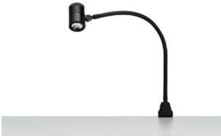
SPOT LED 003 - MCTFL 3 N