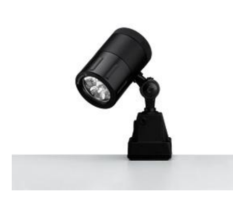
SPOT LED 003 - MCXFL 3 S

connected load fitted with work equipment mains lead luminaire body material surface weight (net) fastening