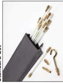
Includes a light weight easy access carry bag

Article Number: 897-90000 Type: CS-SB Description: Designed to perform standard cable installation Content Rods: 10 x 4mm x 1000mm (white) Rod Capacity (m): 10 Content: 150mm white flexi lead, gender changer, tuff hook, mini eye. Attachments: