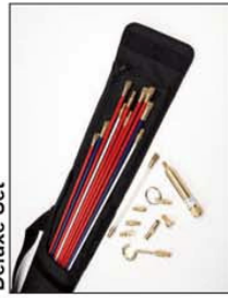
Includes a light weight carry bag with shoulder strap

Article Number: 897-90001 Type: CS-SD Description: The most comprehensive set for carrying out larger installations Content Rods: 2 x 4mm x 1000mm (white) 6 x 5mm x 1000mm (red) 2 x 6mm x 1000mm (blue) Rod Capacity (m): 10 Content: Attachments: 150mm white flexi lead, split ring, gender changer, tuff hook, mini eye, domed bullet, flat bullet, beam, single magnet.