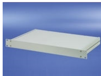
Photo shows 1 U