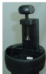
Clamp Fitted to Base