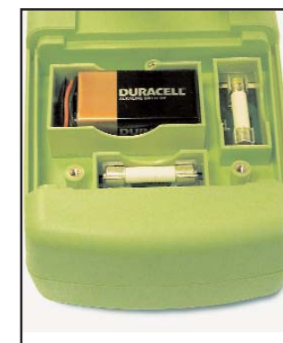
separate battery & fuse compartment