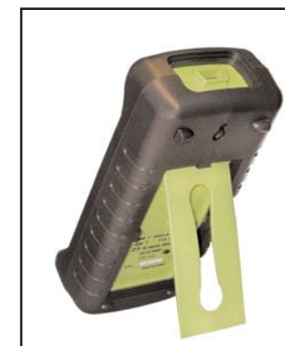
tilt stand on all 190 series DMMs