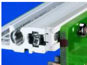
Rear horizontal rail for backplane assembly