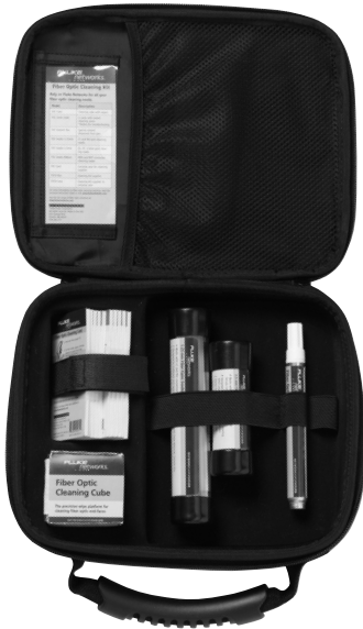
Fiber Optic Cleaning Kit NFC-Kit-Case