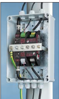
Protectors for the video (ESP CCTV/B, left), camera telemetry (ESP 15E, centre) and the low current mains power (ESP 240-5A, right) inputs to a camera, installed together on a CME 4 mounting and earthing kit. Note that the protectors have been cross bonded to the metal work of the pole (out of shot)

Camera telemetry or control lines should be protected with a suitable Lightning Barrier from the D or E Series. Protectors for the power supply to individual cameras and the mains supply to the control room are available. For coaxial RF (RF Series) cable protectors and CATV systems (ESP CATV/F) are also available.