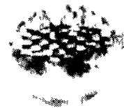
Diagonal or anvil cut.