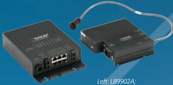
Left: LB9902A; Right: Included AC Power Supply for LB9902A