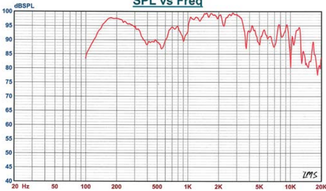
SPL vs Freq

Material / Color ..... PA ABS / RAL9010 Mounting ..... Hooks Termination ..... Spring clamps Weight ..... 1,2 kg IP-rating..... Max. / min. amb. temp ..... 90°C / -20°C Rated / max. power ..... 6 W / 20 W SPL 1W/1m ..... 93 dB SPL rated power ..... 100 dB Effective freq. range ..... 90 – 20000 Hz Dispersion (-6dB) 1kHz / 4kHz ..... 140° / 50° Options..... Impedance, color, label