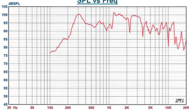
SPL vs Freq

Material / Color .....PA ABS / RAL9010 Mounting..... Hooks Termination..... Spring clamps Weight ..... 1,33 kg IP-rating..... Max. / min. amb. temp ..... 90°C / -20°C Rated / max. power ..... 6 W / 20 W SPL 1W/1m ..... 93 dB SPL rated power ..... 100 dB Effective freq. range.....150 – 20000 Hz Dispersion (-6dB) 1kHz / 4kHz..... 140° / 50° Options.....Impedance, color, label