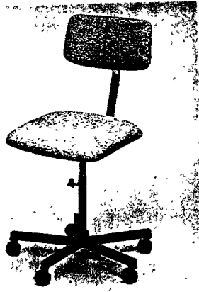
TC5 < TYPIST CHAIR