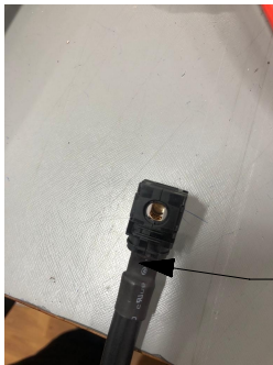
REFER NOTE 3