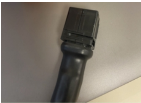
REFER NOTE 4