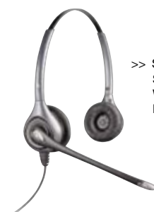
>> SupraPlus Silver Wideband Headset