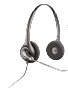
>> SupraPlus Hearing Aid Compatible Wideband Headset