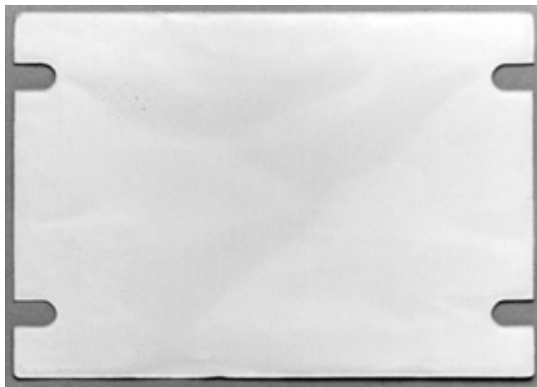
HSP3 Series: Three Phase GN0 and GN3

HSP1 for Single Phase Relay. HSP3 for 3 phase GN0 Series and GN3 Series. Sold in multiples of 25 (1 package) per part number.