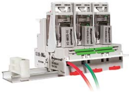
Coil Bus Jumpers colored green for better viewing.