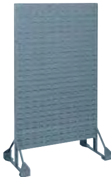
30626 Double-Sided Snap Fastener Louvered Floor Rack (Snap fasteners greatly reduce rack assembly time.) 36" L x 20" W x 60" H 914 x 508 x 1524 mm. 700 lb. capacity.