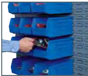
Develop a customized storage system by grouping any of our Louvered Panels.