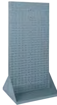
30653 Louvered Floor Rack 35 3 / 4 " L x 32" W x 75 1 / 8 " H 908 x 813 x 1908 mm. 2000 lb. capacity.