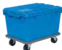
Attached Lid Containers solid steel Dolly (Model No. RU843HR1420) is compatible with Models 39085, 39120, 39170 for efficient parts transport.