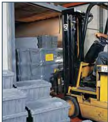
Designed to stack together for easy pallet loading.