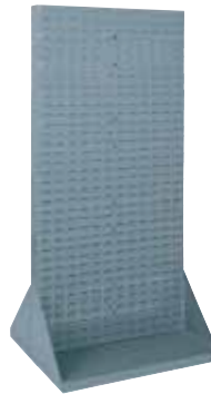
30653 Louvered Floor Rack

36" L x 20" W x 60" H 914 x 508 x 1524 mm. 700 lb. capacity.