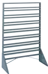
30008 1-Sided, 16 Rail 250 lb. capacity.