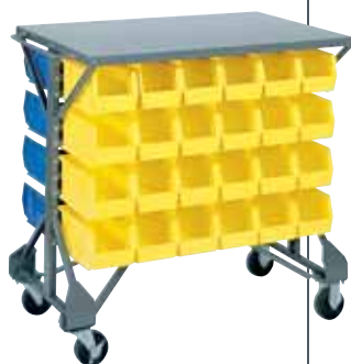
30812 Bin Cart shown with 30230 AkroBins.