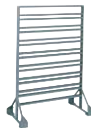
30016 2-Sided Rack, 16 Rail 500 lb. capacity.