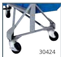
Two-Sided Racks can be mobilized with the mobile kit.