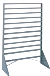
30006 1-Sided, 12 Rail 250 lb. capacity.

Bench racks, wall-mount, and single- or double-sided models are available to create a complete storage system.