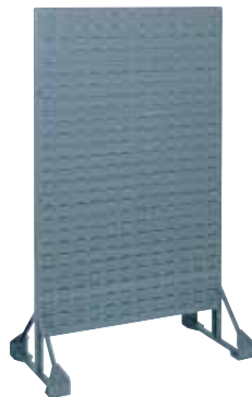
30626 Double-Sided Snap Fastener Louvered Floor Rack

(Snap fasteners greatly reduce rack assembly time.)