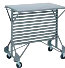
30812 Bin Cart w/ Casters 14-gauge steel work top. 250 lb. capacity.