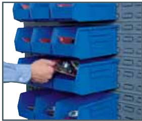
Develop a customized storage system by grouping any of our Louvered Panels.