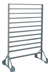
30012 2-Sided Rack, 12 Rail 500 lb. capacity.