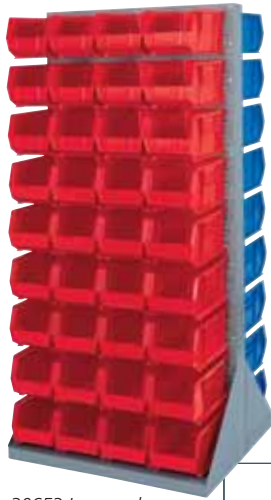
30653 Louvered Floor Rack shown with 30239 AkroBins.