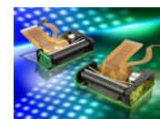
Printer mechanisms & interfaces