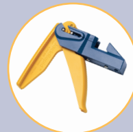
JackRapid™ Punchdown Tool