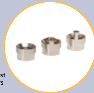
Fiber Test Adapters