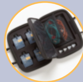
DTX Fiber Modules Carrying Case