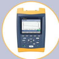
OptiFiber® Certifying OTDR

Check our complete line of SuperVision products like these at www.flukenetworks.com