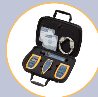
SimpliFiber™ Loss Test Kits