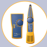
IntelliTone™ Pro Toner and Probe