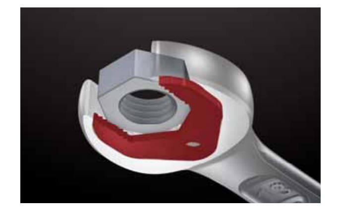
\label{lem:avoids} \textbf{Avoids slipping off fasteners, for faster work!}

Installation of the nut - no additional tools required!