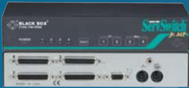
SW628A-R2: top: front view; bottom: rear view