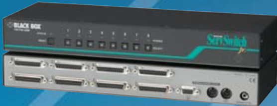
SW629A-R2 top: front view; bottom: rear view