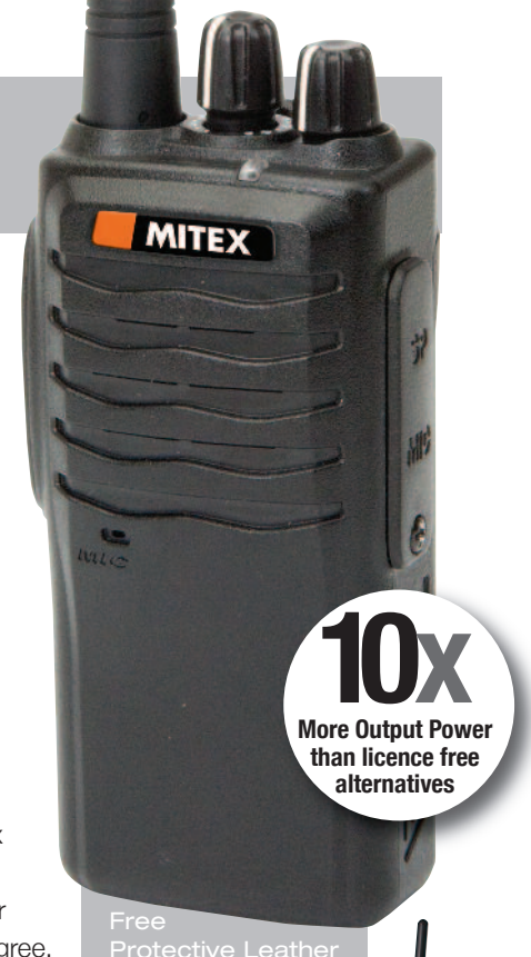
Protective Leathe Case Included

Mitex units are extremely durable and are manufactured to the highest standards possible. They give clear and reliable communication, even in the harshest of environments. Mitex supply ready to use 'straight from the box' two way radio communications that simplify the solution to your communications requirements. Mitex Radios offer a quick and easy way to create communications in most applications and are programmed back to back for quick and easy use. We believe we are the future for most Business, Security, Site, Country and Sport comms applications, we hope you agree.