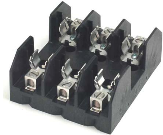
3 pole shown