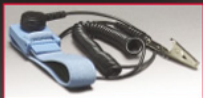
Anti-Static wrist strap