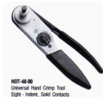
HDT-48-00 Universal Hand Crimp Tool Solid Contacts