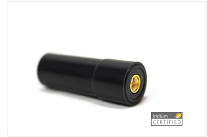
Image does not reflect the actual size of the antenna

M1621HCT-SMA is a high performance antenna designed for the Iridium band, built on proprietary Maxtena HeliCore® technology. This technology provides exceptional pattern control, polarization purity and high efficiency in a very compact form factor. The M1621HCT-SMA is a screw-on design, featuring an integrated SMA connector. This product is ideal for applications requiring minimal integration effort or for retrofitting existing products. The design is equipped with an O-ring that makes the antenna waterproof once installed on a mating surface.