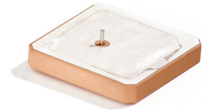
Image does not reflect the actual size of the antenna

This is a high-performance, very low profile antenna product designed for embedded applications, ideal for GPS handhelds, PDAs and tracking devices. The very compact size and lightweight features make this GPS embedded antenna one of a kind in the market and perfect for various commercial and industrial applications. With a typical high efficiency of 90%, this antenna can operate in the most extreme and demanding applications giving maximum satellite reception and great accuracy. The interface connector is a through pin solution.