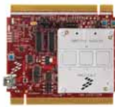
Kinetis Tower System (TWR-K60X256-KIT)

Finally, the decoding layer enables the key detected to be included in a decoder control that treats the detection as a part of the keypad, slider or rotary interface. TSI is an MCU peripheral designed to scan up to 16 electrodes. It is a highly robust touch-sensing method which also minimizes the need for CPU resources to process touch-sensing signals. Conversion time is guaranteed while the resolution is not reduced across typical hardware conditions.