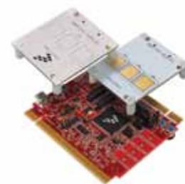
TWRPI Plug-In Starter Kits