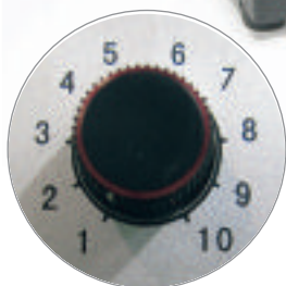
Variable Temperature Scale