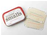
Adafruit Perma-Proto Small Mint Tin Size Breadboard PCB - 3 pack