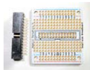
Adafruit Small-Size Perma-Proto Raspberry Pi Breadboard PCB Kit