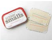
Adafruit Perma-Proto Small Mint Tin Size Breadboard PCB - 3 pack