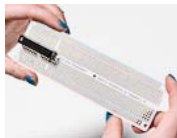
Adafruit Perma-Proto Raspberry Pi Breadboard PCB Kit