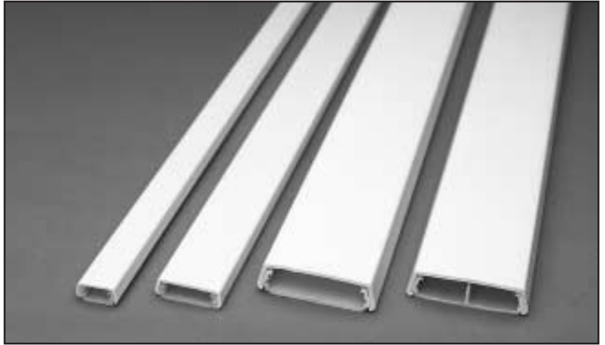
400, 800, 2300, and 2300D

The 400, 800, and 2300 Series, from The Wiremold Company, is a family of single compartment raceways for communication or power applications ideal for use in classrooms, office, and hotel applications or anywhere a small low profile raceway is needed. The 2300D Nonmetallic Divided Raceway is for use when power and low voltage cabling is required in the same raceway.