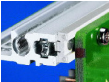
Indirect backplane mounting (with insulation strips)