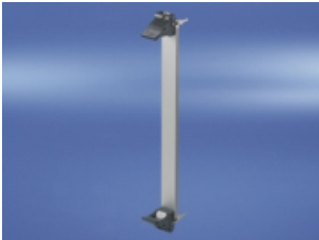
Illustration shows front panel 6 U, 4 HP